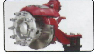
Front Disk Brake