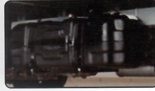
40L Fuel Tank